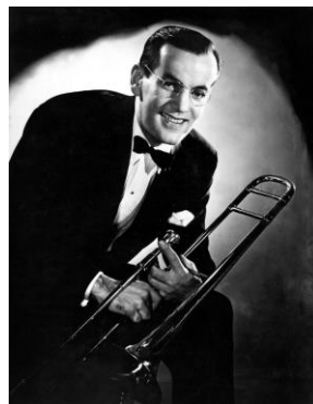
Glenn Miller – Trombonist 1904- 1944 (Swing band)