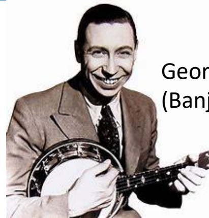
George Formby (Banjo ukulele)