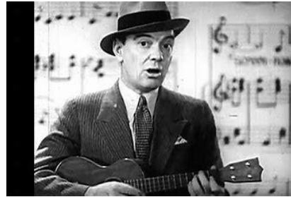
Cliff Edwards (ukulele Ike)