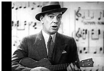
Cliff Edwards (ukulele Ike)