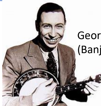
George Formby (Banjo ukulele)