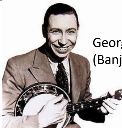
George Formby (Banjo ukulele)