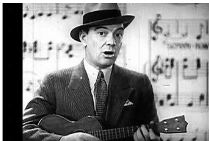
Cliff Edwards (ukulele Ike)