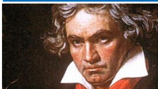
Ludwig van Beethoven 1770-1827

Folk Music – Music transmitted orally, music with unknown composers, or music performed by customs over a long period of time.