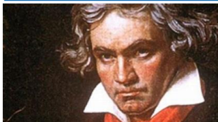
Ludwig van Beethoven 1770-1827

Folk Music – Music transmitted orally, music with unknown composers, or music performed by customs over a long period of time.