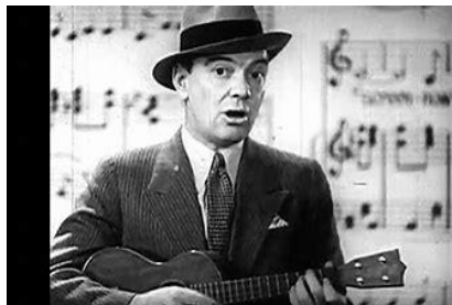
Cliff Edwards (ukulele Ike)