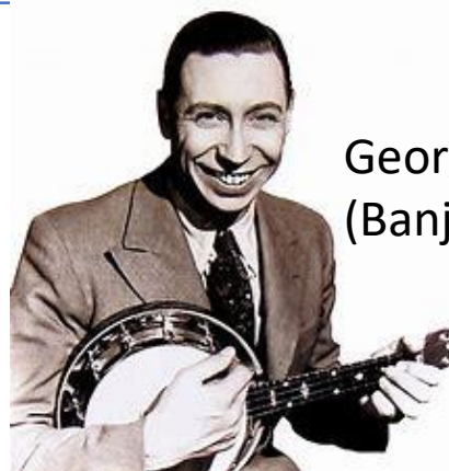
George Formby (Banjo ukulele)