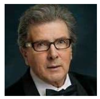
Howard Blake OBE - English composer of 'The Snowman'