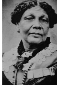
Left – Mary Seacole