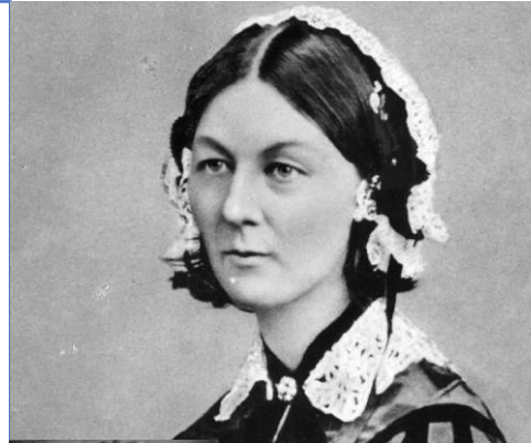
Above – Florence Nightingale