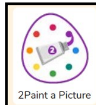
2Paint a Picture