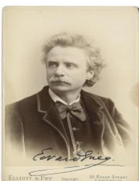
Edvard Grieg - Peer Gynt Suite