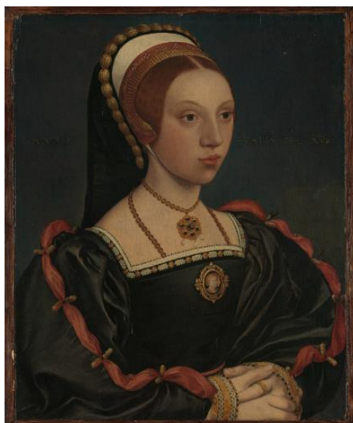
warm and cool colours – cool backgrounds/warm foregrounds