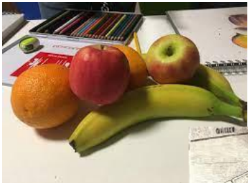
Setting up still life groups