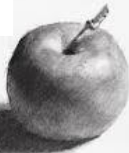
shading and shadows

The surface quality that the artist has created.