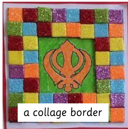
a collage border