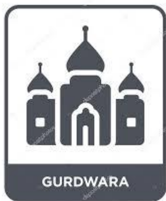
a simple digital design