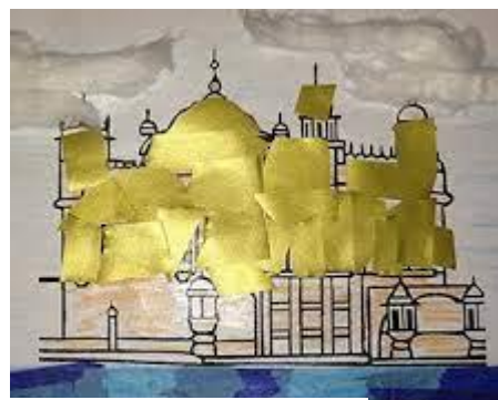
using collage to overlay