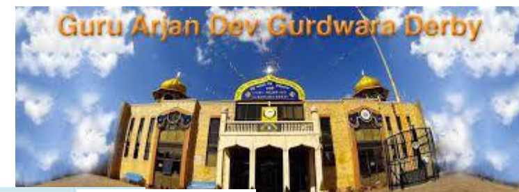
digital images of Gurdwara