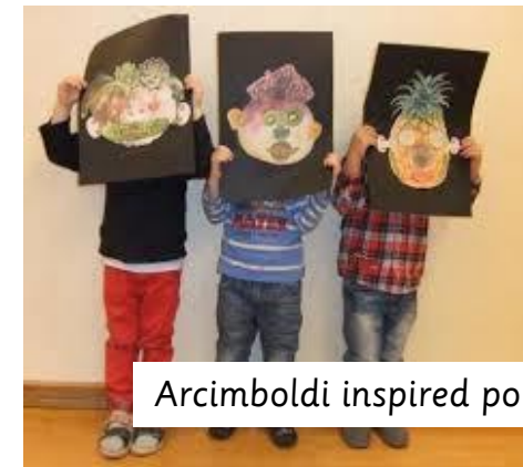
Arcimboldi inspired portraits