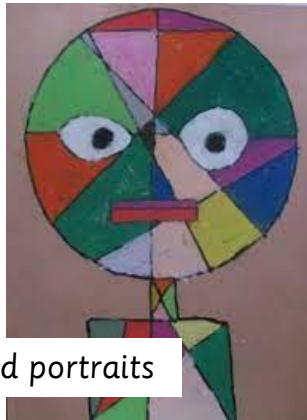
Klee inspired portraits